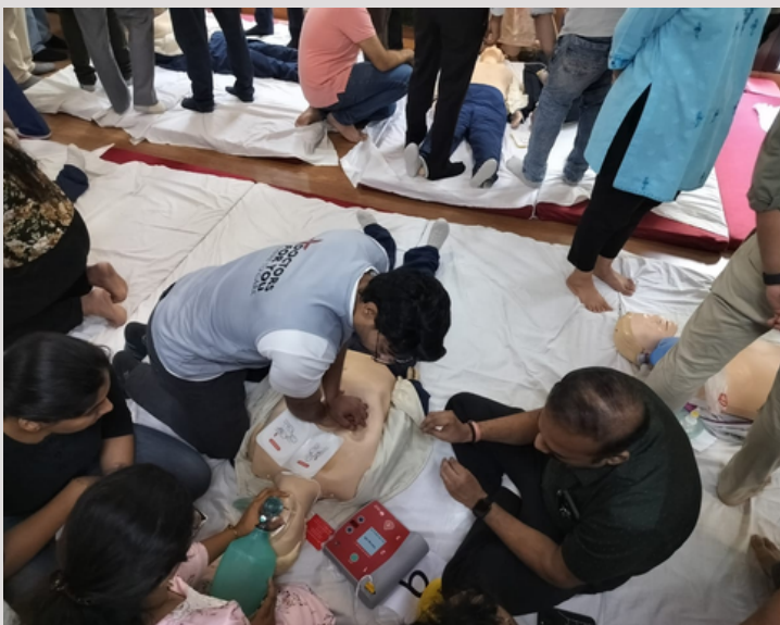
Basic Life Support (BLS) training, IRIA House, New Delhi.